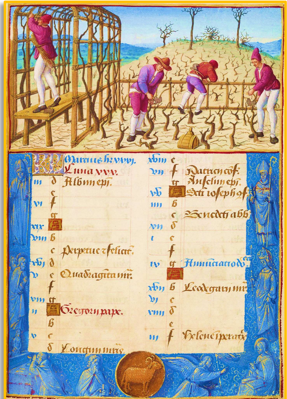
Pruning the Vines, from the Hours of Henry VIII, illuminated by Jean Poyer, France, ca. 1500